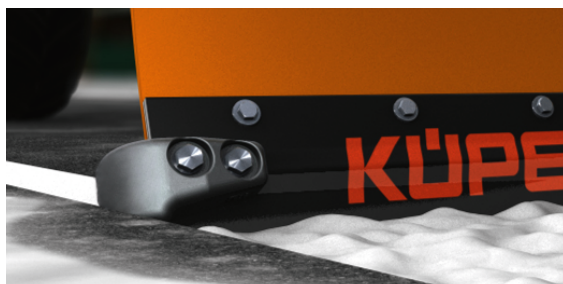
Küper curbstone deflector

A snow clearing blade accessory specifically developed for demanding requirements on the road. Durable, flexible and efficient.